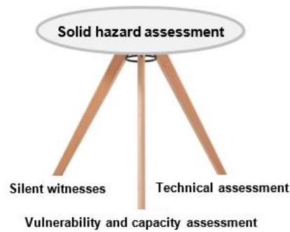
Figure 2: Methodological elements of a solid hazard assessment