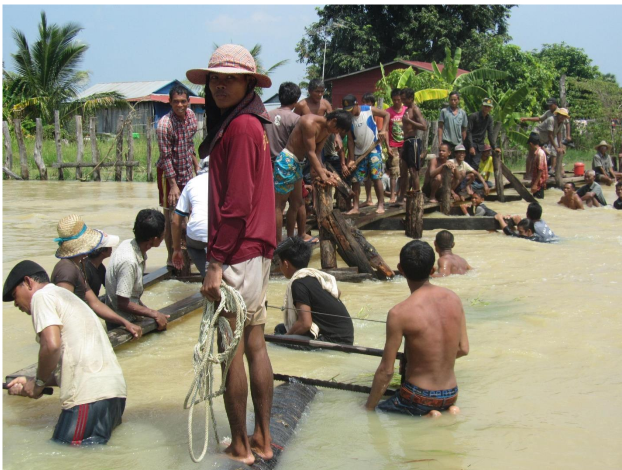
Local communities involved in building a bridge, Cambodia