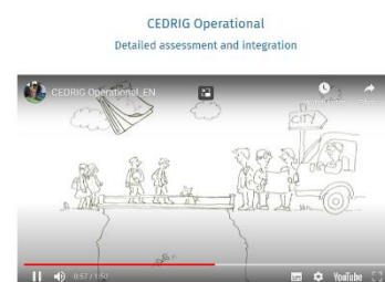
CEDRIG Operational Detailed assessment and integration (1:50)

Please also have a look at the CEDRIG Light Guide for a very good introduction to the stepwise approach of the screening.