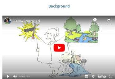
CEDRIG Conceptual Background (2:06)