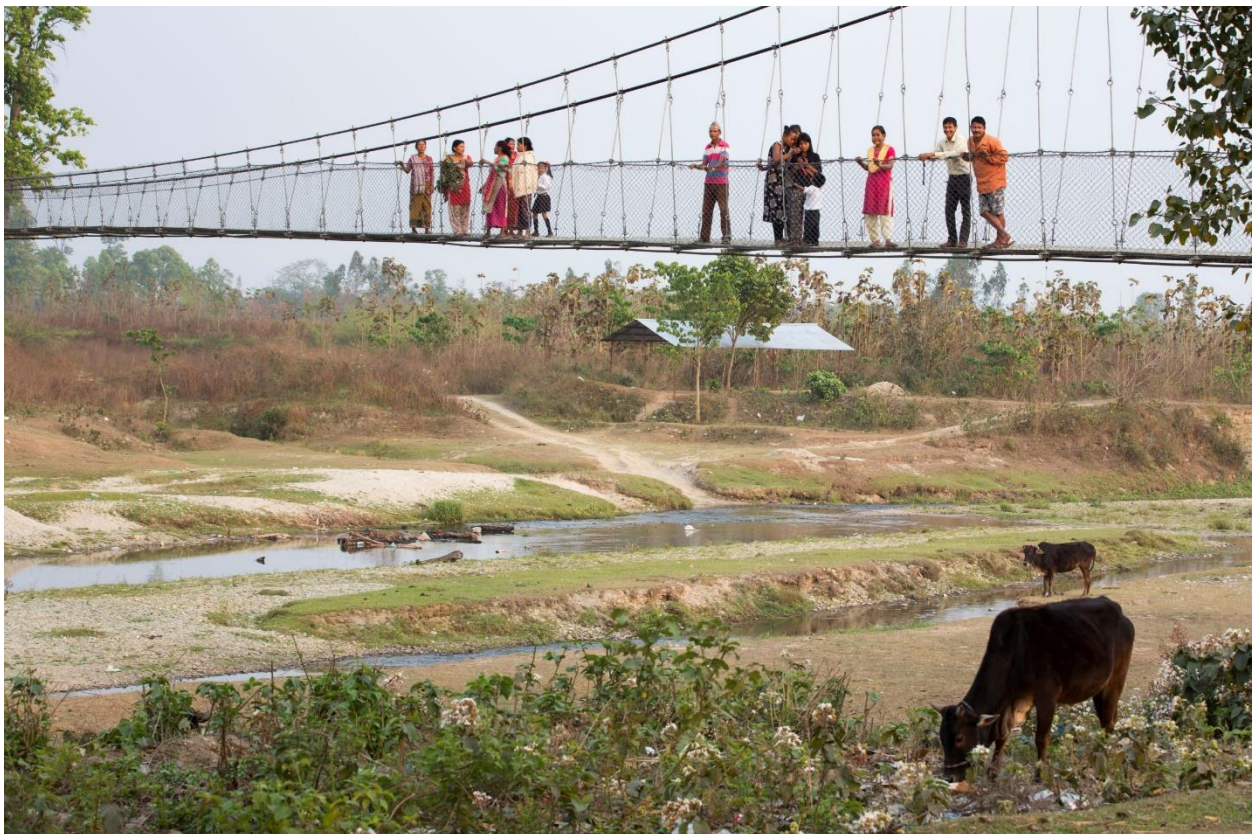
Masanghat Trail Bridge, Nepal